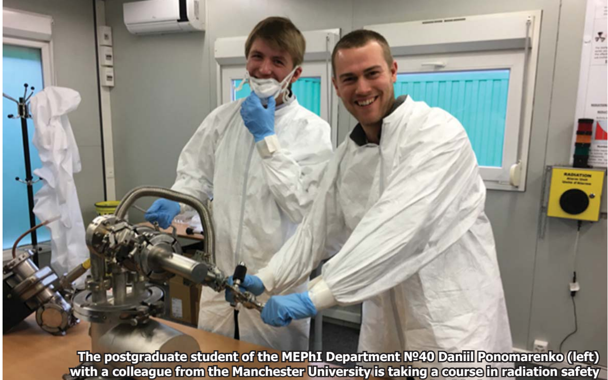
prior to the work with the TRT DAQ system

dates in the subsystems. TRT has replaced the computing power of DAQ from 32 to 64 bit systems that is associated with big changes in hardware and software systems. The group of MEPhI takes an active part in these works".